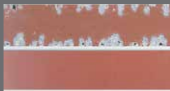
(TOP) SINGLE-COAT POLYESTER OVER METAL FROM A SCRAP-BASED MINI-MILL (BOTTOM) ALUMALURE® 2000 PANEL