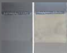
ALUMALURE® 2000 COMPETITOR'S POLYESTER