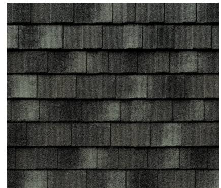
DECRA SHINGLE XD Natural Slate